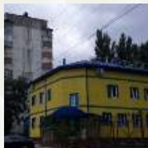
8. State Treasury Institution of Public Health "Tuberculosis Dispensary" Ministry of Health and Resorts of the Kabardino-Balkarian Republic.