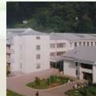
20. State Budgetary Institution of Public Health "City Clinical Hospital No. 2".