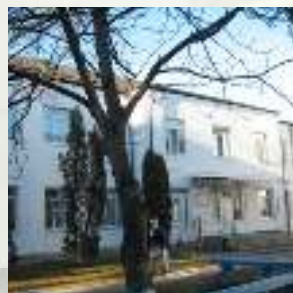
9. State Budgetary Institution of Public Health "Oncology Dispensary" of the Ministry of Health and Resorts of the Kabardino-Balkarian Republic.