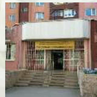
14. State Budgetary Institution of Public Health "City polyclinic No. 2".