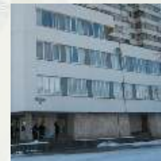
18. State Budgetary Institution of Public Health "City polyclinic No. 7".