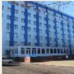
7. State Budgetary Institution of Public Health "Republican Clinical Hospital" of the Ministry of Health and Resorts of the Kabardino-Balkarian Republic.