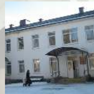
15. State Budgetary Institution of Public Health "City polyclinic No. 3".