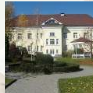
12. State Treasury Institution of Public Health "Republican Gerontological Rehabilitation Center" of the Ministry of Health and Resorts of the Kabardino-Balkarian Republic.