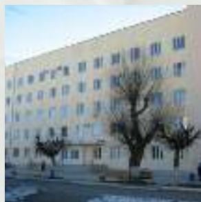
3. State Budgetary Institution of Public Health "Perinatal Center" of the Ministry of Health and Resorts of the Kabardino-Balkarian Republic.