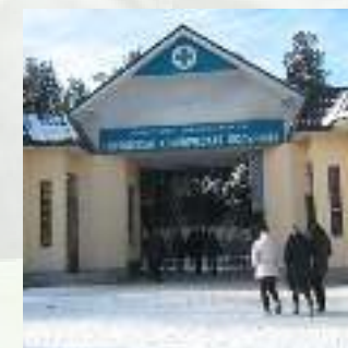
19. State Budgetary Institution of Public Health "City Clinical Hospital No. 1".