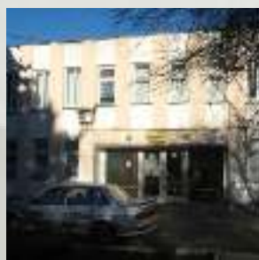
5. State Treasury Institution of Public Health "Narcological Dispensary" of the Ministry of Health and Resorts of the Kabardino-Balkarian Republic.