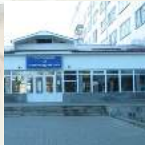
6. State Budgetary Institution of Public Health "Cardiology Center" of the Ministry of Health and Resorts of the Kabardino-Balkarian Republic.