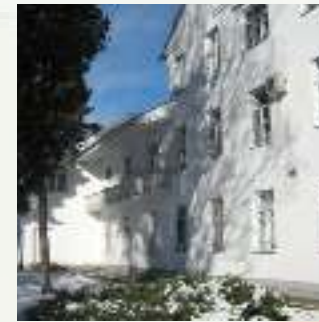
11. State Budgetary Institution of Public Health "Dermatovenerologic Dispensary" of the Ministry of Health and Resorts of the Kabardino-Balkarian Republic.