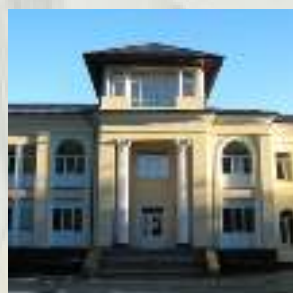
10. State Budgetary Institution of Public Health "Center for the organization of specialized allergological care" of the Ministry of Health and resorts of the Kabardino-Balkarian Republic.