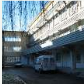
1. State Budgetary Institution of Public Health "Republican Children's Clinical Hospital" of the Ministry of Health and Resorts of the Kabardino-Balkarian Republic.