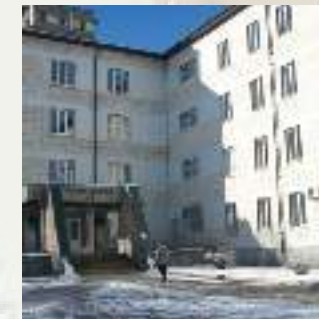
17. State Budgetary Institution of Public Health "City polyclinic No. 5".