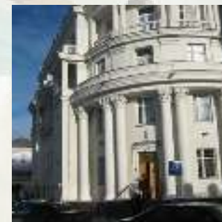
13. State Budgetary Institution of Public Health "City polyclinic No. 1" of the city district Nalchik.