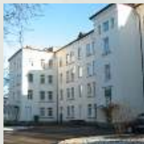
4. State Budgetary Institution of Public Health "Center for the Prevention and Control of AIDS and Infectious Diseases" of the Ministry of Health and Resorts of the Kabardino-Balkarian Republic.