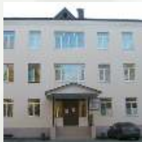
2. State Treasury Institution of Public Health "Psychoneurological Dispensary" of the Ministry of Health and Resorts of the Kabardino-Balkarian Republic.